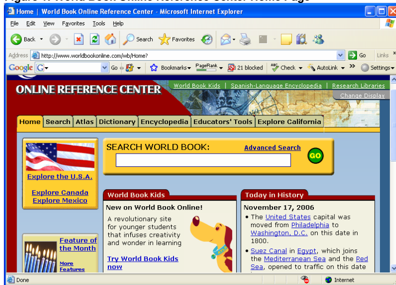
Figure 1: World Book Online Reference Center Home Page

Supplementary content in WBORC includes over 750 interactive maps and links to articles, the World Book Dictionary, and selected articles from EBSCO. Also included are more than 12,000 pictures, web links, audio files for pronunciations, videos and animations, and more